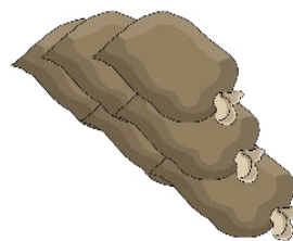
Use suitable barriers

If you do have excess concrete you should allow this to harden. This can then (potentially) be used as general fill on site as required. Alternatively, solid material can be sent off-site to an authorised waste management facility, in accordance with the duty of care for waste.