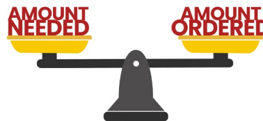
Only order the amount you need