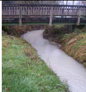
A stream contaminated with surface run-off.

It is important that your bunds are regularly inspected, maintained and collected rainwater regularly removed and disposed of properly.