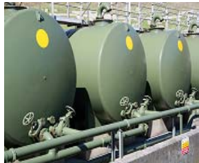
Storage tanks inside a concrete bund.